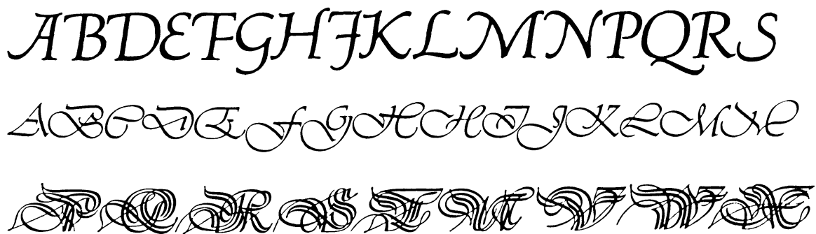
Figure 10 (top to bottom). (a) Palatino Italic Swash caps, (b) Vivaldi caps, and (c) Magnificat caps.

Specialists in computer animation have had to deal with the problem of interpolation of different forms. For example, in a television series about evolution, there was a sequence showing the outline of one animal slowly transforming into another one. But one cannot simply tell the computer, “Interpolate between this shape and that one!” To each point in one there must be explicitly specified a corresponding point in the