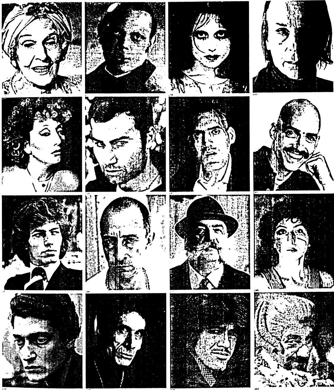
Figure 2. The category of human faces (drawn from [Strich 81]).