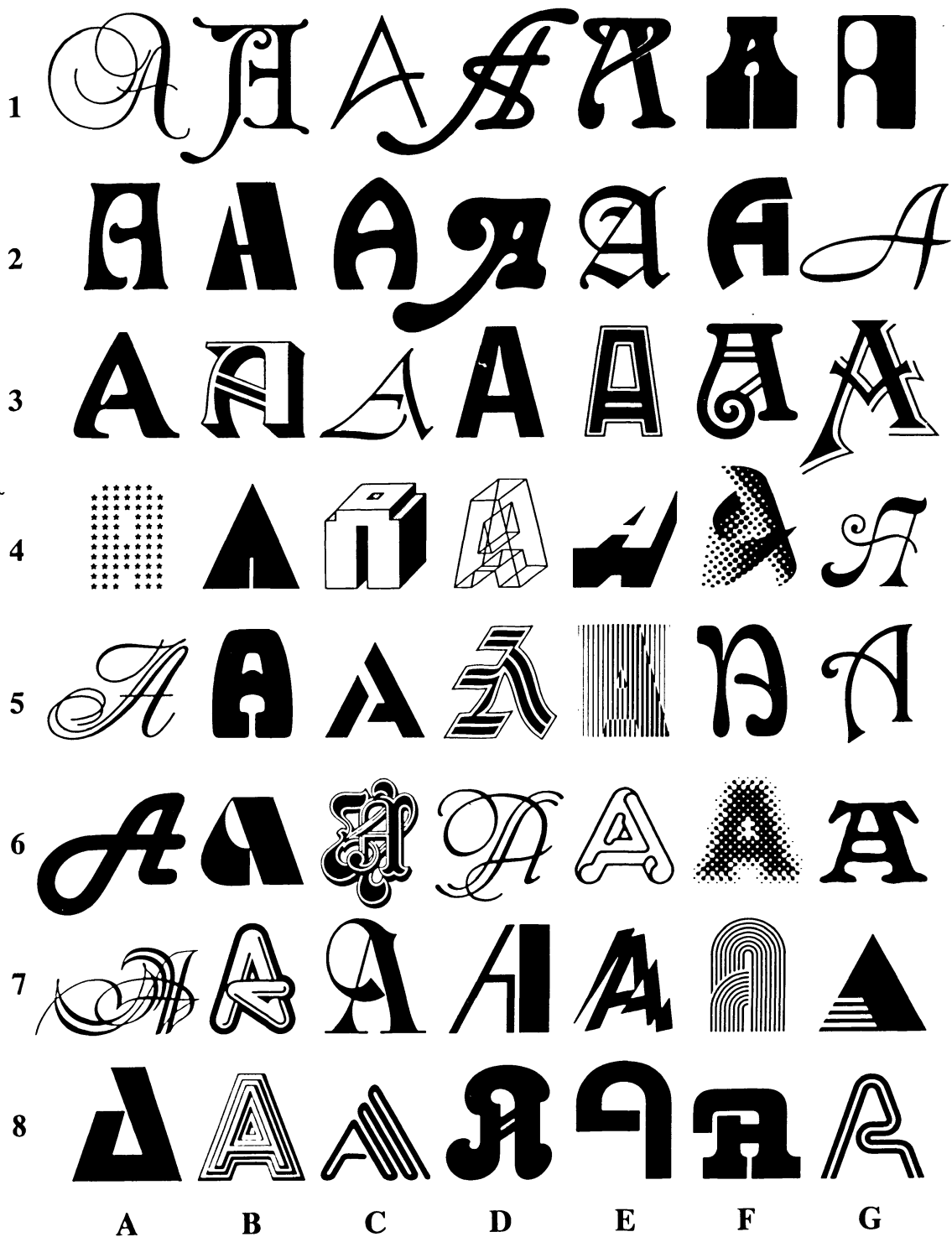
Figure 1. The category of “A”’s (drawn from [Letraset 81]).