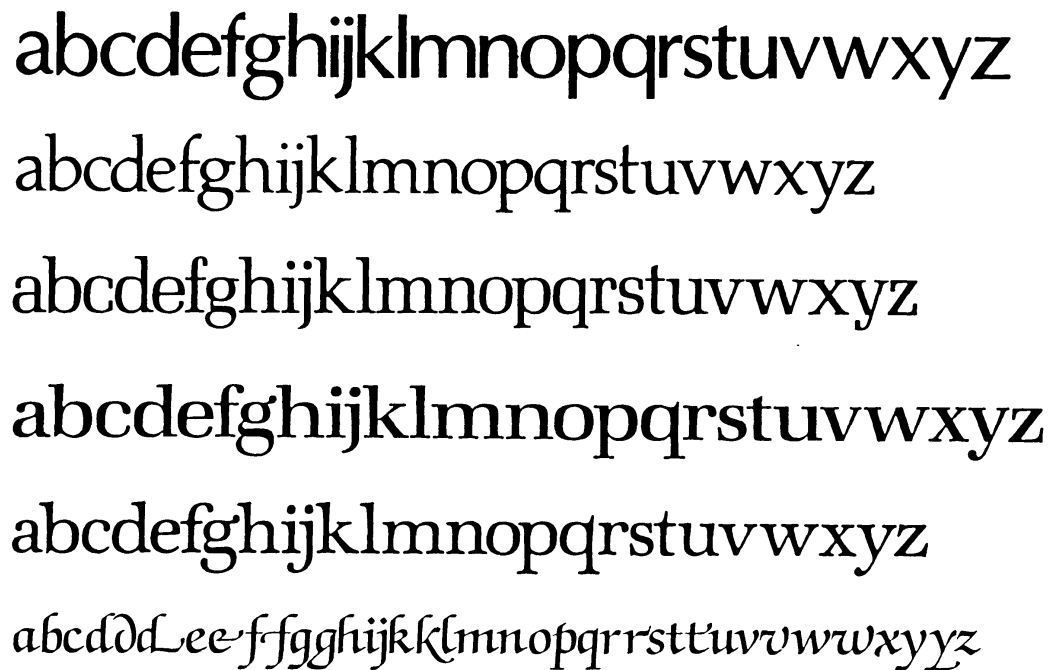
Figure 14. A few faces designed by Hermann Zapf (top to bottom). (a) Optima, (b) Palatino, (c) Melior, (d) Zapf Book, (e) Zapf International, and (f) Zapf Chancery.

Moreover, a fourth dimension can be added if you imagine many such “layercakes,” one for each distinguishable period of typographical design. Thus our fourth dimension, like Einstein’s, corresponds to time. Now one can ask about each layercake, “What do all the items herein have in common?” This is a three-dimensional question. Presumably, one could carry this exercise even further.