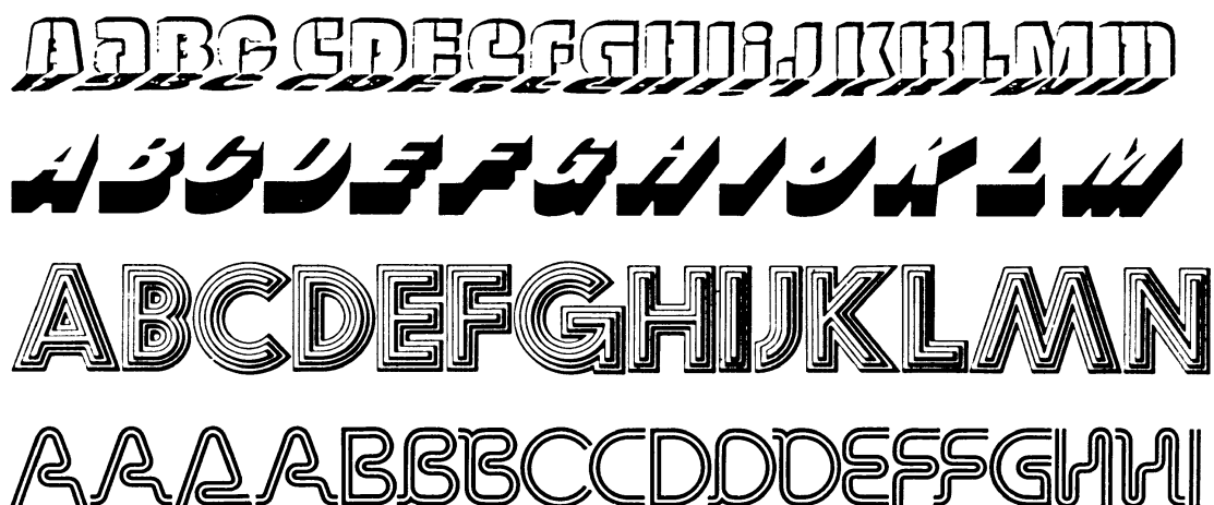
Figure 9 (top to bottom). (a) Sunrise, (b) Buster, (c) Stack, and (d) Double.

spired by various extant typefaces such as Sunrise, Buster, Stack, Double, and so on [Figure 9a, b, c, d]. I leave it to readers to try to imagine such variants.