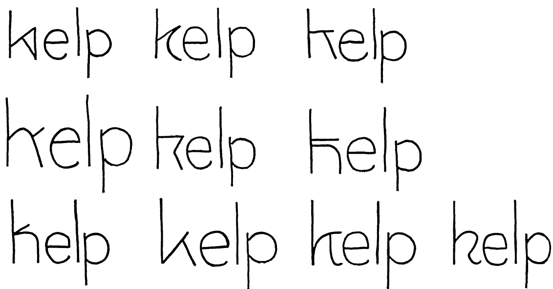
Figure 12. Versions of “h” and “k” as rivals for the same typographical niche.

In other words, a computer program to design typefaces (or anything else with an esthetic or subjective dimension) is not an impossibility; but one should realize that, no less than a human, any such program will necessarily have a “personal” taste--and it will almost certainly not be the same as its designers’ taste. In fact, to the contrary, the program’s taste will quite likely be full of unanticipated surprises to its programmers (as well as to everyone else), since that taste will emerge as an implicit and remote consequence of the interaction of a myriad features and factors in the architecture of the program. Taste itself is not directly programmable. Thus, although any esthetically programmed computer will be “merely doing what it was programmed to do,” its behavior will nonetheless often appear idiosyncratic and even inscrutable to its programmers, reflecting the fact--well known to programmers--that often one has no clear idea (and sometimes no idea at all) just what it is that one has programmed the machine to do!