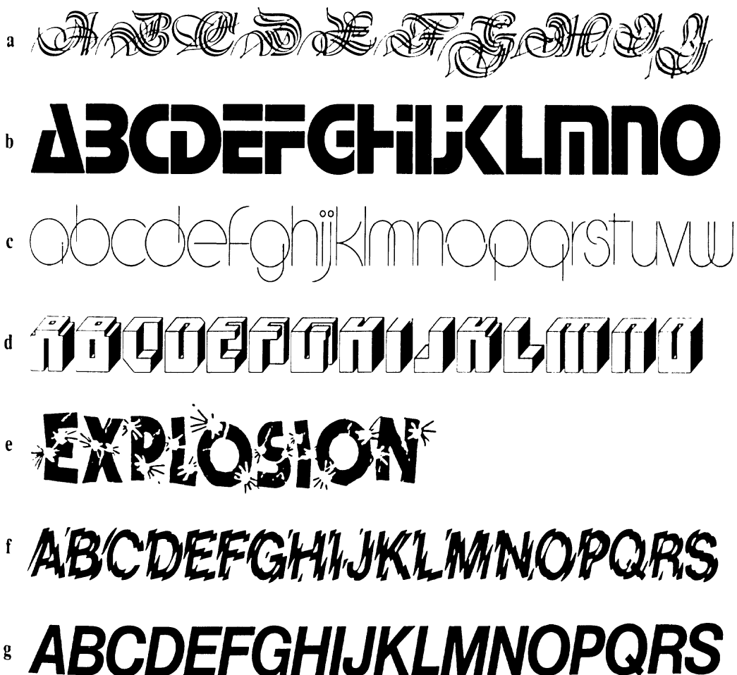
Figure 7. (a) Magnificat, (b) Stop, (c) Cirkulus, (d) Block Up, (e) Explosion, (f) Shatter, and (g) Helvetica Medium Italic.

Each of these two typefaces [Figure 7a, b] is ingenious, idiosyncratic, and visually intriguing. I challenge any reader to even imagine a blend halfway between them, let alone draw it! And to emphasize the flexibility implied by the question, how about trying to imagine a typeface that is (say) one third of the way between Cirkulus and Block Up [Figure 7c, d]? Or one that is somewhere between Explosion and Shatter [Figure 7e, f]?